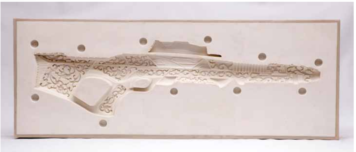
Detail of 2-part silicon mold.