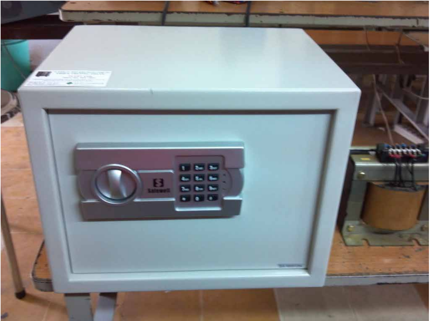
Production image of safe in progress of attaching timer and other electronic parts.