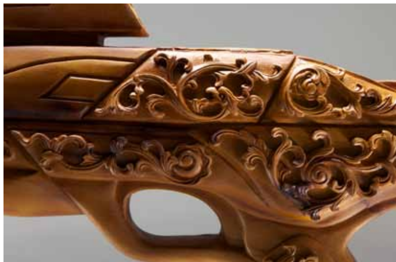
Details of carved wooden phaser rifle.