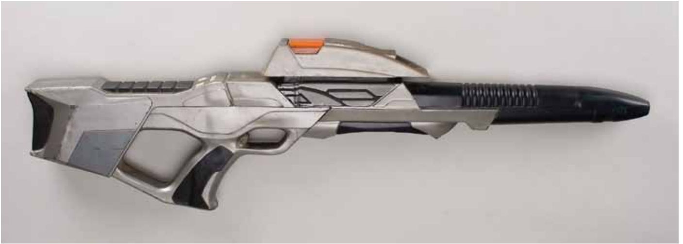
Original phaser gun prop from sci-fi television/movie series.